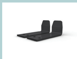
Linking parts (2 pcs.)