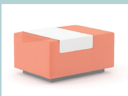
Metal table placed on the pouf (black or white colour)